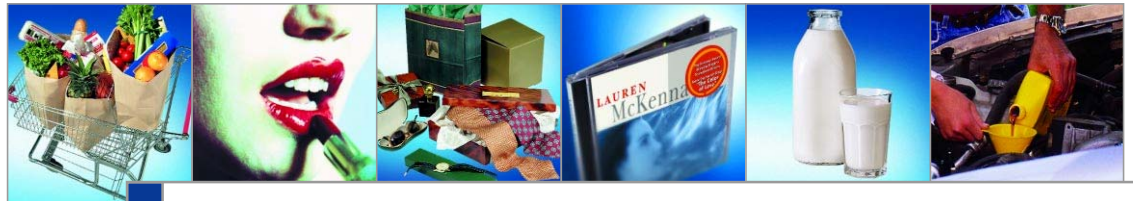
Auto Splice Dual Unwinder With Festoon